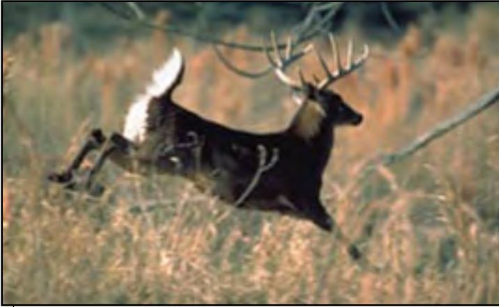
Home range size for white-tailed deer can be from 60 to 800 acres or more.