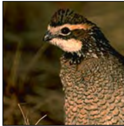
For quail, the habitat must supply many seeds and insects.

Herbicides can be used with caution. Do not use non-selective, broadcast herbicide treatments: They can decrease loafing cover when few brush species are present. However, herbicides applied as individual plant treatments offer great selectivity and flexibility for brush management.