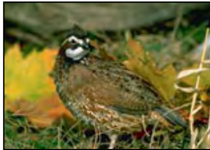
Quail need vegetation less than 6 inches tall for roosting.