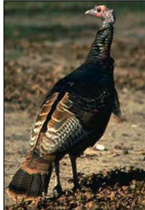
Turkeys prefer to nest in rangeland in high conditions.