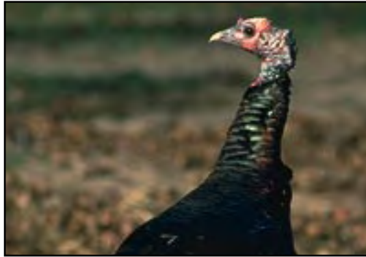
Distribution of turkeys in Texas is controlled mostly by precipitation.

Turkeys do best with more mature stands of brush, whereas quail prefer brush less than 5 years old. Turkeys prefer to nest in rangeland in high condition. Turkey hens need clumps of residual grass about 2 feet in diameter and 1.5 feet tall; quail need 8x12-inch clumps. Nesting turkeys appear to seek ungrazed pastures or those in a grazing system.