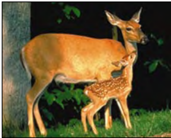
Hiding cover is especially important during fawning season.

The diet of white-tailed deer in Texas is varied and changes with the seasons (Figure 1). They prefer forbs and mast, which are highly seasonal and can vary greatly from one year to